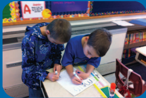
Crestview students work on their homemade cards.

In its fifth year, A & O: Support Services for Older Adults provided holiday gifts to 148 older adults in the community. In total, the Be a Santa to a Senior Program provided holiday gifts to almost 1,000 older adults across Winnipeg, an increase of almost 300 gifts from 2011. A & O would like to thank the program's sponsor, Home Instead Senior Care, our generous donors and the students at Crestview School for making homemade cards for our participants.