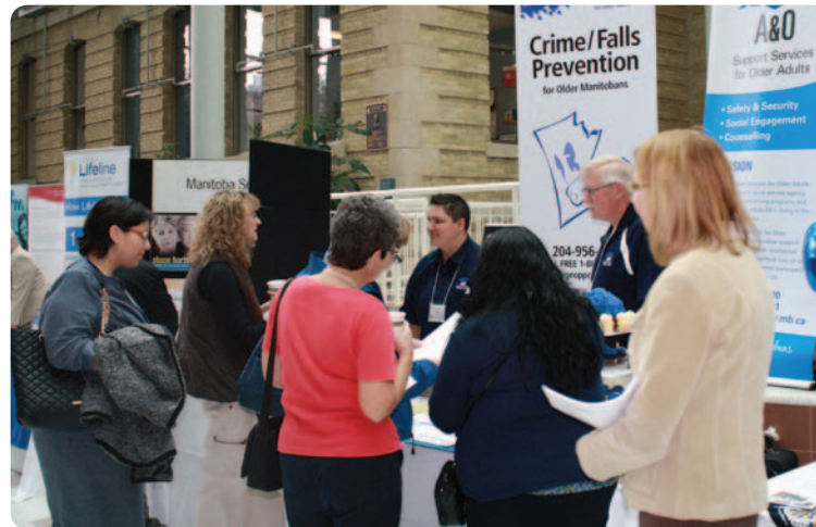
The SafetyAid program is promoted at the Centre on Aging Spring Symposium