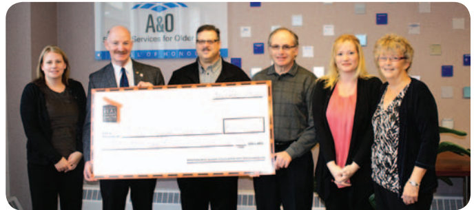
Manitoba Real Estate Association's Shelter Foundation presents a cheque to the Safe Suite Program

"I'm excited about my future again. That was something that was taken away from me." – Safe Suite client