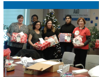
Volunteers wrapping gifts for older adults

This program would not be possible without the hundreds of generous donors who braved the winter weather to shop for someone that may not have otherwise received a gift. Thank you for brightening the holidays for older adults!