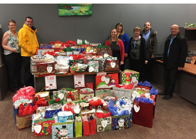
The Property Registry donated 100 gifts to Be a Santa to a Senior

To meet the growing demand, A & O hired a Program Coordinator to manage the program. With a dedicated coordinator, we were able to arrange events and personalized visits. The Great West Life Holiday Choir performed for the residents at 101 Marion, a group of grade 2 students from Glenwood School visited and performed for the residents at Chez Nous and many donors hand delivered gifts and visited participants, making the holiday less lonely.