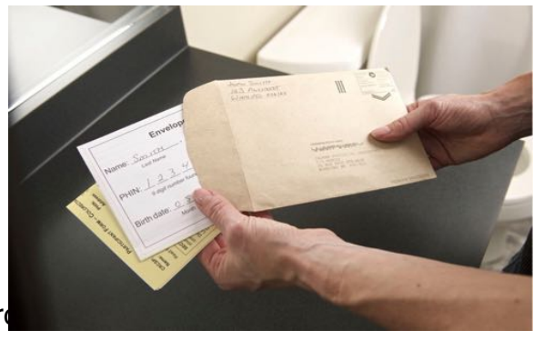
Screening Program - Get Checked!