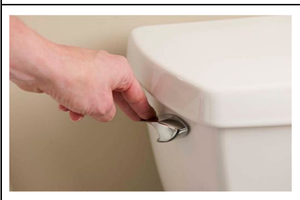
Step B: Prepare the toilet Flush the toilet and allow the bowl to refill.

Step A: Prepare the test card - Write your name and the date you are collecting your sample on the first card.