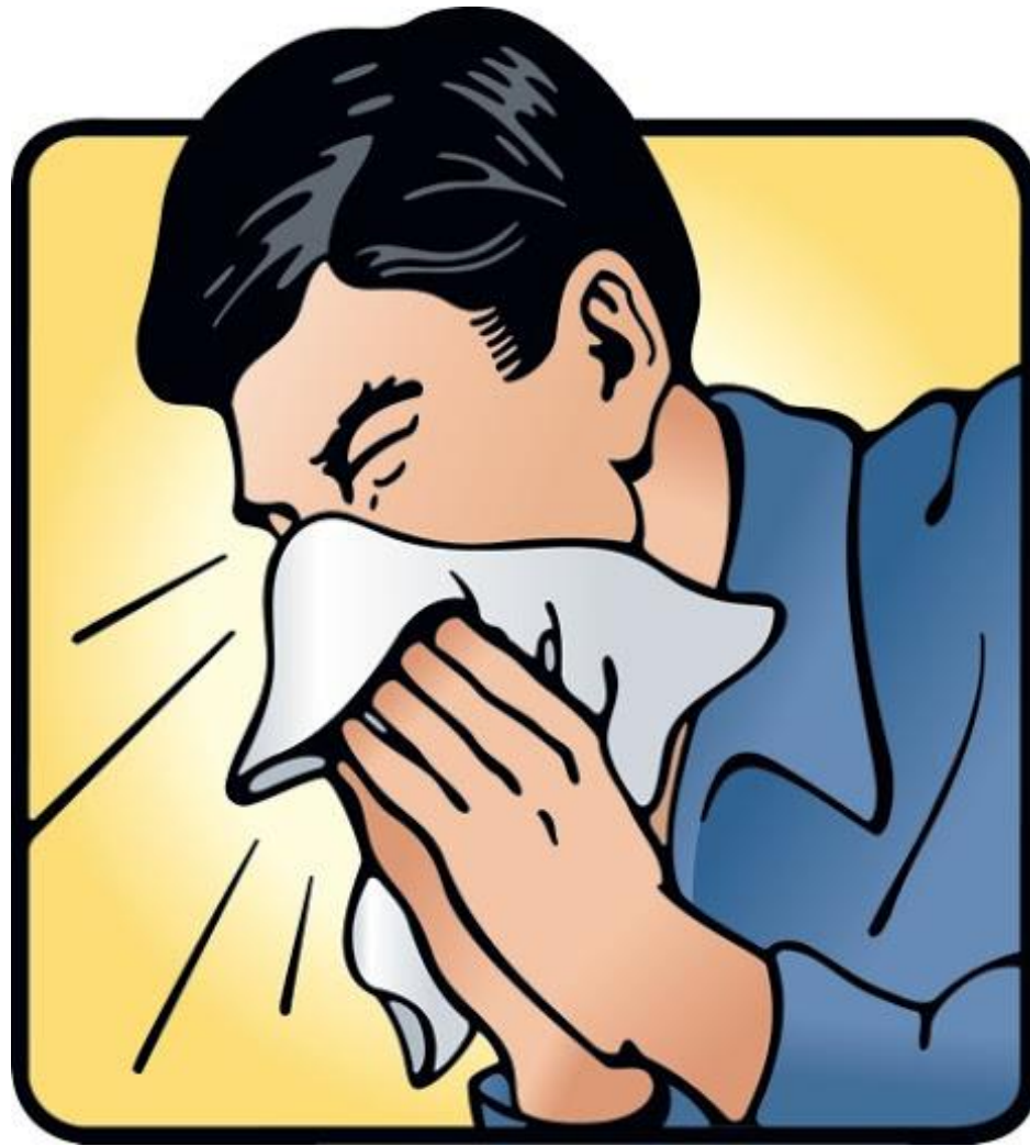
Sneeze or blow your nose into a tissue