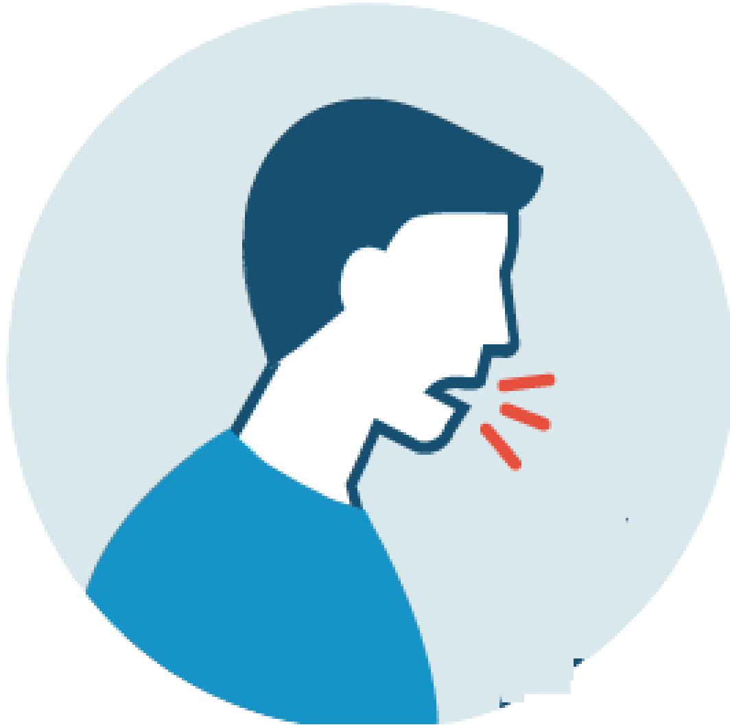
a dry cough