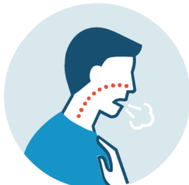
shortness of breath