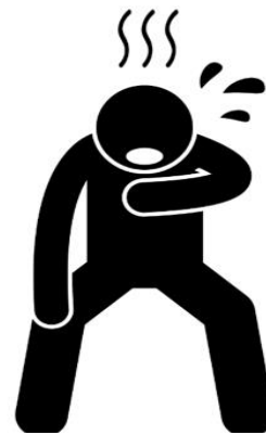
Urgent Symptom: gasping for air