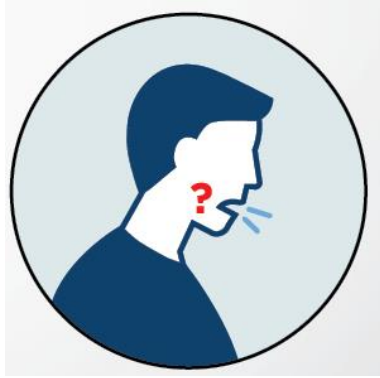
sudden loss of taste and smell